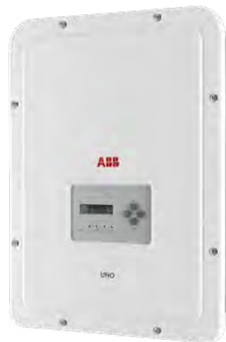
ABB string inverters UNO-DM-1.2/2.0/3.0-TL-PLUS 1.2 to 3.0 kW