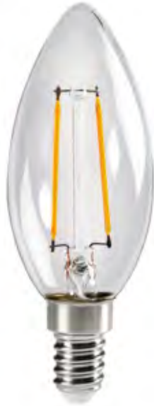
XLED C35E14 2,5W