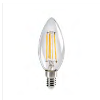
XLED C35E14 4,5W