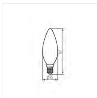
XLED C35E14 2,5W, XLED C35E14 4,5W