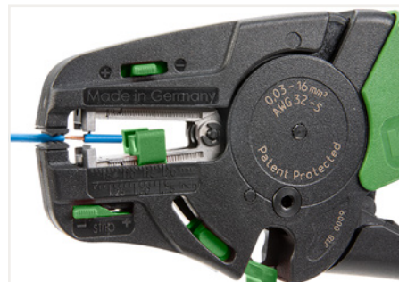
Partially stripping a conductor.