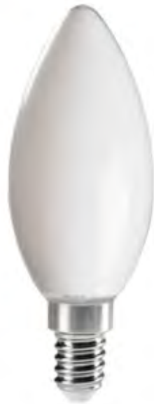
XLED C35E14 4,5W-WW-M