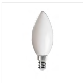
XLED C35E14 4,5W, XLED C35E14 6W