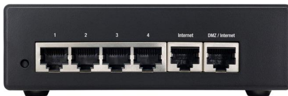
Figure 2. Back Panel of the Cisco RV042

Figure 2 shows the back panel of the Cisco RV042. Figure 3 shows a typical configuration.