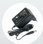
24V 1.2A Adapter