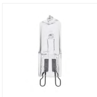
G9-20W; 33W; 48W; 60W STAR