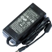
24V 2.5 A power adapter