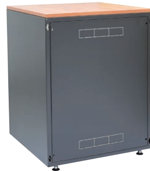
SJB 15 U cabinet finished in RAL 9005, with desk- top made of Calvados-laminated MDF board