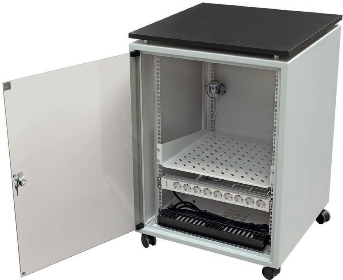
SJB 15 U cabinet finished in RAL 9005, equipped with black desktop, castors and other accessories