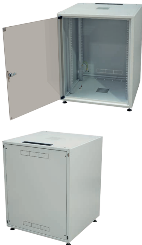
SJB 15 U cabinet finished in RAL 7035, without desktop